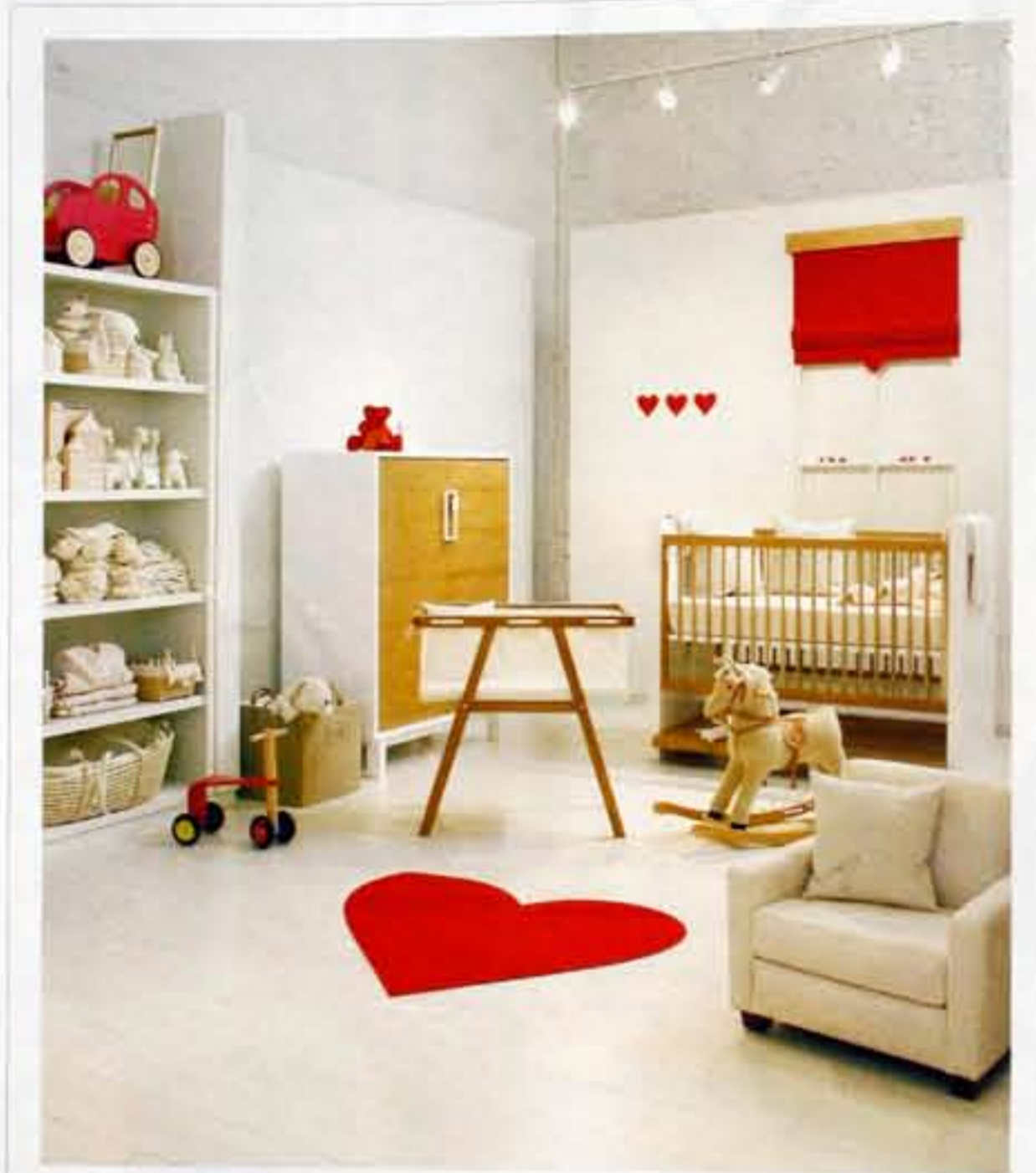
One of six vignettes in the store, this modern nursery is filled with furniture pieces from the Netto Collection. Chair, felt rug and window treatment designed by Nancy Braithwaite.

F OR THE AVERAGE stressed out mom-to-be, the opening of the elegant, yet fun, baby boutique B. Braithwaite is nothing short of an answer to her prayers. I myself am six months pregnant and have yet to pick out a name for my child, much less the crib, linens, color-scheme or any theme required to pull off today's requisite finished nursery. But Nancy Braithwaite and her daughter Chaffee have made one-stop-shopping for nursery decor not only possible, but pleasurable. Braithwaite has pre-designed six nurseries and two toddler rooms complete with furniture, linens, wallpapers, window treatments, and a few signature accessories. Each room can be customized with